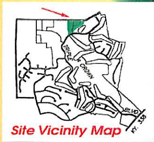
Site Vicinity Map